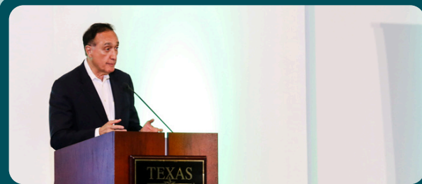
The Honorable Henry Cisneros, keynote speaker on the economic benefits of the Great Springs Project for the Austin-San Antonio region during Trail Connect V, November 6, 2023.

From tourism to legislative districts, every community that touches the trail and its corresponding parks and green space will experience the effects of this tremendous civic project. You are cordially invited to sponsor this work and have your company publicly listed as an economic driver. Supporters of this work will be featured in the report, in the press release, on the GSP website, and publicly recognized throughout the report's dissemination.